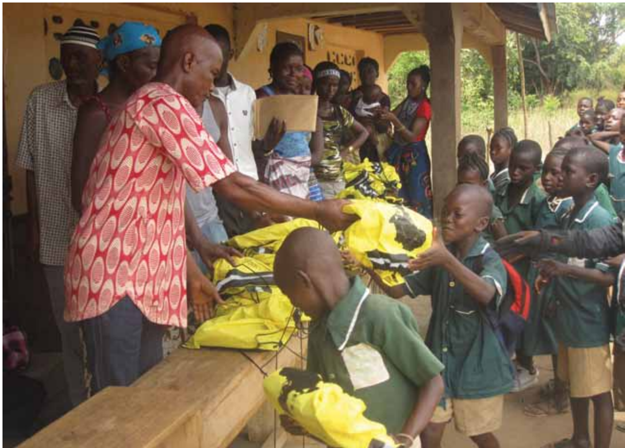
Handling of school supplies to the children of RoTumba Primary School

In Sierra Leone, Education for Hope partners with the Sierra Leone Library Board, teachers, academic institutions, and community members to conduct needs assessments and to determine the best way to support communities that promote literacy and lifelong learning.